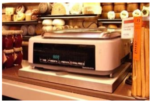
Weigh Scale Labels